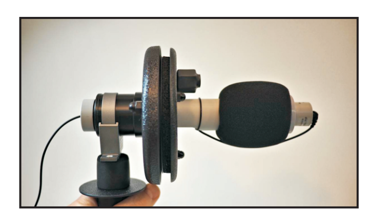
Step 10. Your assembly is now complete and should look like this, except your parabolic dish would be installed.