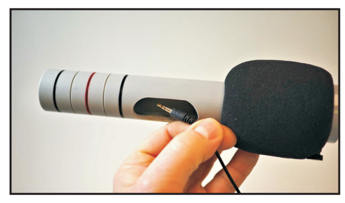
Step 5. Thread the 3.5mm cable through the cable slot of the Mic Tube.