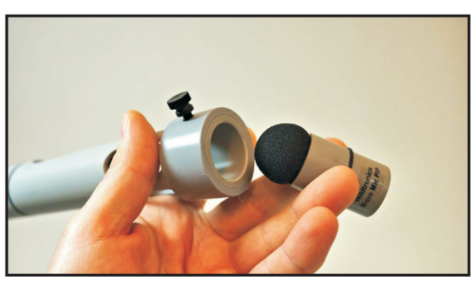
Step 2. Insert the Micro Mic PIP into the Mic Tube, wind screen first, until the O-ring is seated against the Mic Tube.