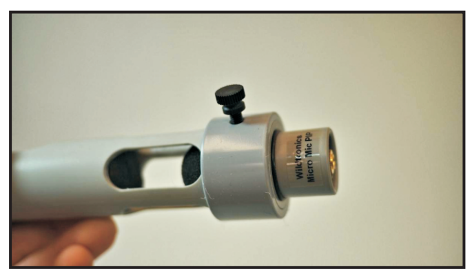
Step 3. Clamp the Micro Mic PIP in place by tightening the nylon thumbscrew.