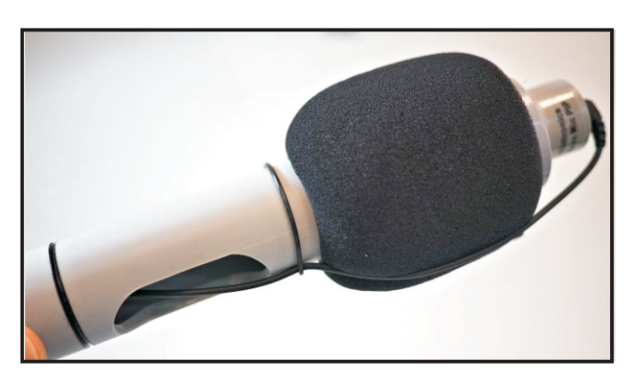
Step 6. Install one of the included O-rings onto the Mic Tube, at the location shown, to retain the 3.5mm cable.